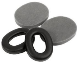
Hygiene kit – Replacement foams Reference : PEL SPO2