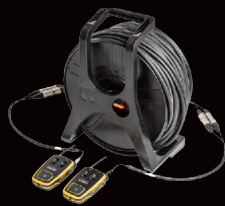
Bobine PRO 461